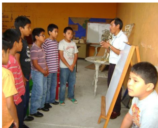
Receiving music lessons!