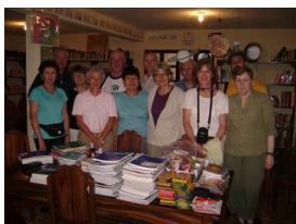
Donation from Ossian Lutheran Supplies